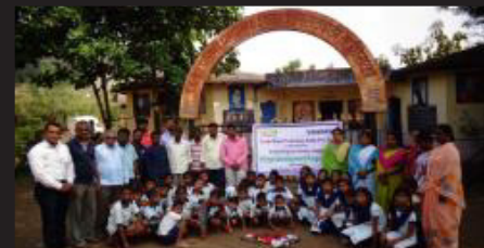
Infrastructure support for local school and medical camp at nearby villages around service site Gude-Pachgani, Maharashtra