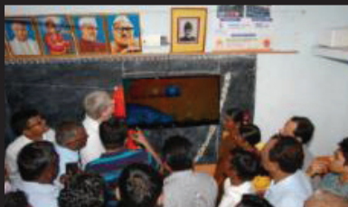
Digitization of Government schools around Taralkatti project site