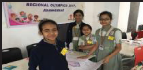
A World in Motion Event by SAE international based on STEM (Science, Technology, Engineering & Math) education organized at Blade Factory, Ahmedabad